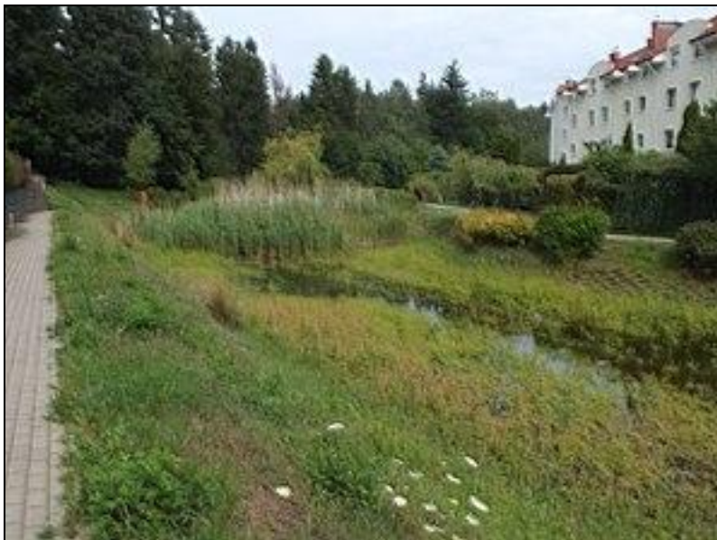
Site 3. Gdynia-Chwarzno CF34 (PM); 54°30'4"N, 18°26'24"E; Kashubian Lake District (Pojezierze Kaszubskie); woodland edge near a storm water management pond with well-developed stands of bulrushes Typha , reeds Phragmites and rushes Juncus .