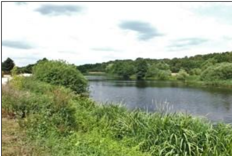
Site 7. Gdańsk-Przymorze CF43 (PM); 54°24'57"N, 18°36'17"E; Vistula Spit (Mierzeja Wiślana); near one of the ponds in the Ronald Reagan Park.