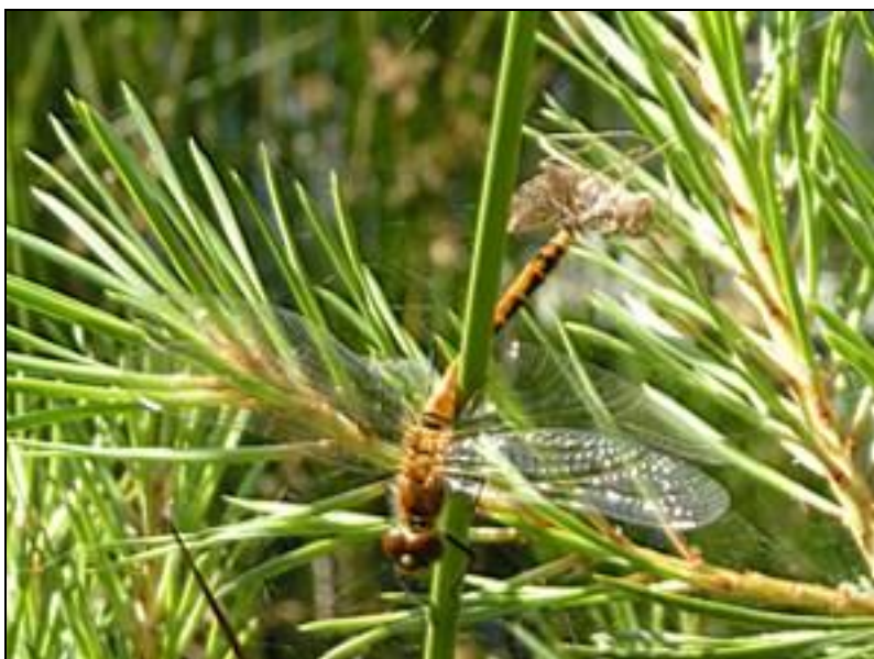
Photo 5. Sympetrum danae ♀ teneral 31.07.2004. Site 10 – Lake Rąbówko, Bieszkowice CF24