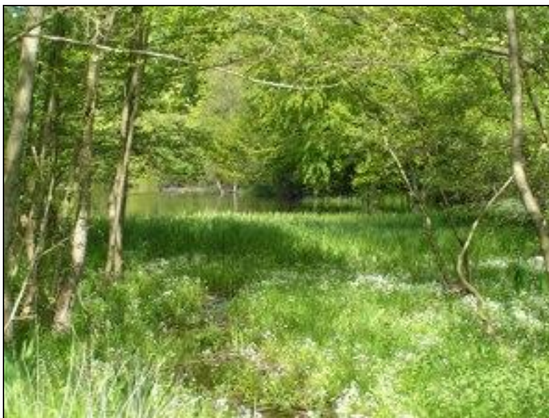
Site 19. Lake Przywidzkie, Przywidz CF20 (PM); 54°11'48"N, 18°21'24"E; Kashubian Lake District (Pojezierze Kaszubskie); a stream running through riparian woodland by the lake.