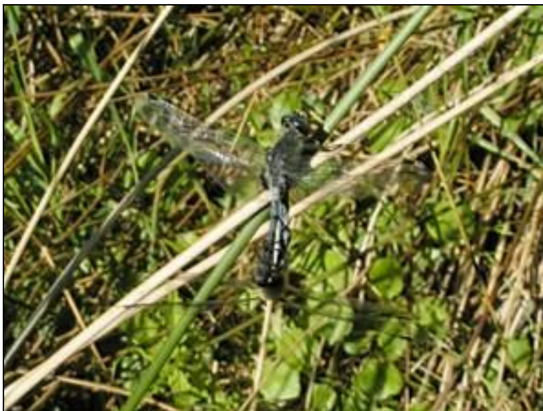
Photo 8. Leucorrhinia albifrons tandem 2.07.2006. Site 11 – Lake Pałsznik, Bieszkowice CF24