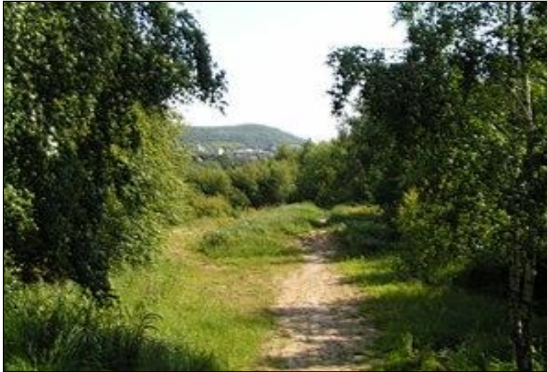
Site 5. Gdynia-Orłowo CF43 (PM); 54°28'20"N, 18°32'36"E; Kashubian Lake District (Pojezierze Kaszubskie); scrub.