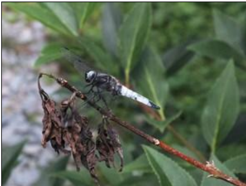
Photo 4. Libellula fulva ♂ 11.07.2014. Site 20 – Wirty- Borzechowo CE27