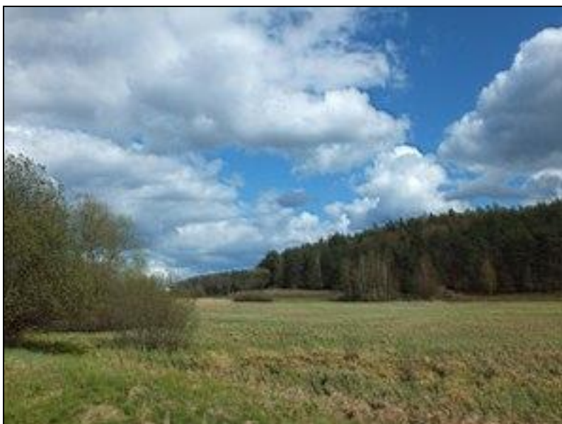
Site 4. Gdynia-Wielki Kack CF33; 54°27'48"N, 18°30'4"E; Kashubian Lake District (Pojezierze Kaszubskie); by an overgrown lake.