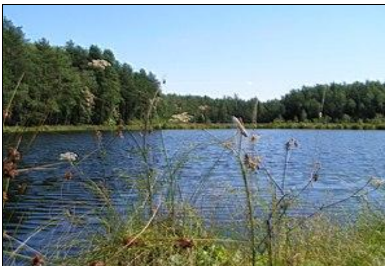
Site 13. Nożyno XA62 (PM); Polanów Upland (Wysoczyzna Polanowska); 54°19'45"N, 17°29'19"E; waterside vegetation by a small lake.