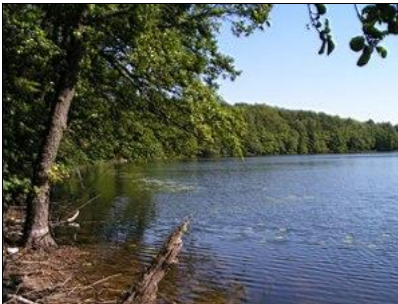
Site 11. Lake Pałsznik, Bieszkowice CF24 (PM); 54°32'7"N, 18°14'35"E; Kashubian Lake District (Pojezierze Kaszubskie); edge of the lake.