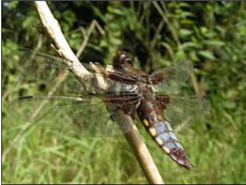
Photo 3. Libellula depressa ♂ 19.08.2008. Site 3 – Gdynia Chwarzno CF34