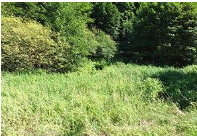
Site 9. Koleczkowo-Piekietko CF24 (PM); 54°30'54"N, 18°19'29"E; Kashubian Lake District (Pojezierze Kaszubskie); wetland vegetation by the River Zagórska Struga.