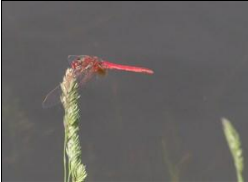
Photo 6. Sympetrum fonscolombii ♂ 29.05.2007. Site 3 – Gdynia Chwarzno CF34