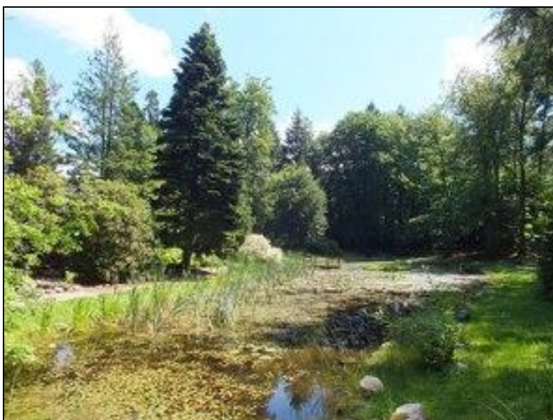
Site 20. Wirty-Borzechowo CE27 (PM); 53°53'49"N, 18°22'44"E; Starogard Lake District (Pojezierze Starogardzkie); near an overgrowing pond in the Wirty arboretum.