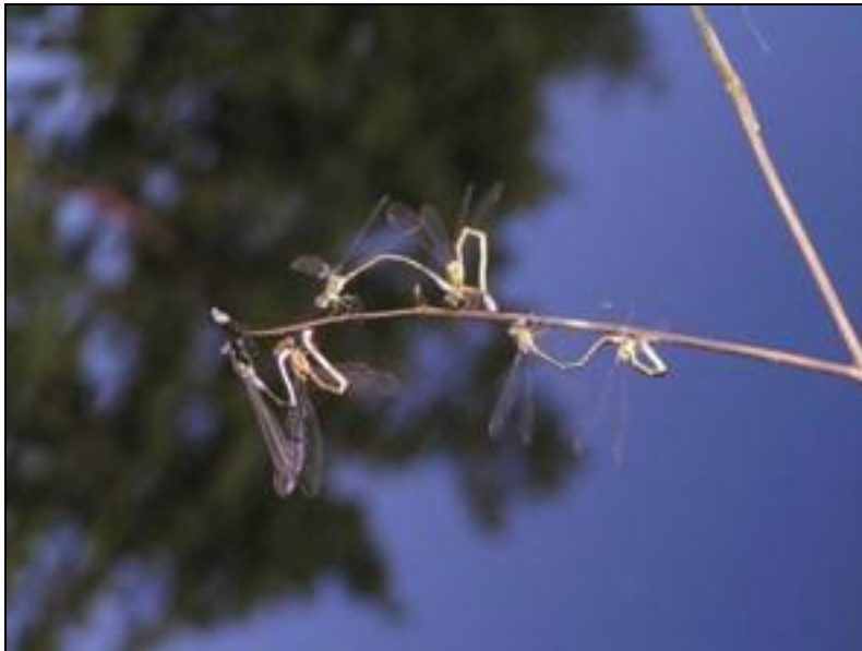
Photo 1. Lestes sponsa (tandem, left). Lestes virens (two tandems, right) 5.08.2007. Site 13 – Nożyno XA62

Widespread, and locally fairly common in northern Poland. Inhabits various types of standing waters; if these are eutrophic, those with rich vegetation are preferred.