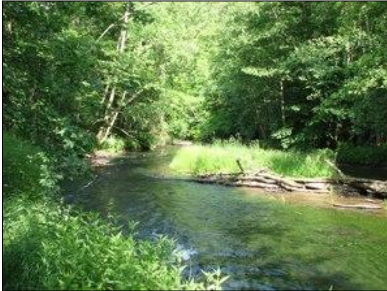
Site 18. River Radunia, Babi Dół CF22 (PM); 54°18'24"N, 18°18'28"E; Kashubian Lake District (Pojezierze Kaszubskie); waterside vegetation with overhanging trees.