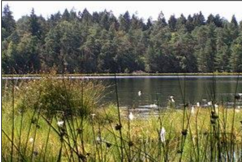
Site 10. Lake Rąbówko, Bieszkowice CF24 (PM); 54°31'3"N, 18°15'35"E; Kashubian Lake District (Pojezierze Kaszubskie); waterside vegetation.