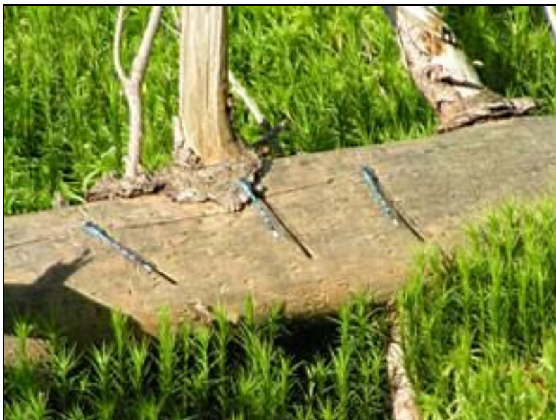
Photo 2. Enallagma cyathigerum ♂♂ 31.07.2004. Site 10 – Lake Rąbówko, Bieszkowice CF24