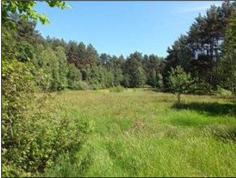
Site 2. Gdynia-Wiczlino CF34 (PM); 54°28'46"N, 18°25'16"E; Kashubian Lake District (Pojezierze Kaszubskie); wet meadow by the River Kacza.