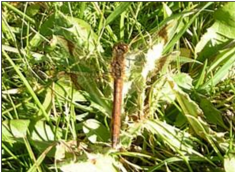
Photo 7. Sympetrum pedemontanum ♀ 3.10.2012. Site 3 – Gdynia-Chwarzno CF34